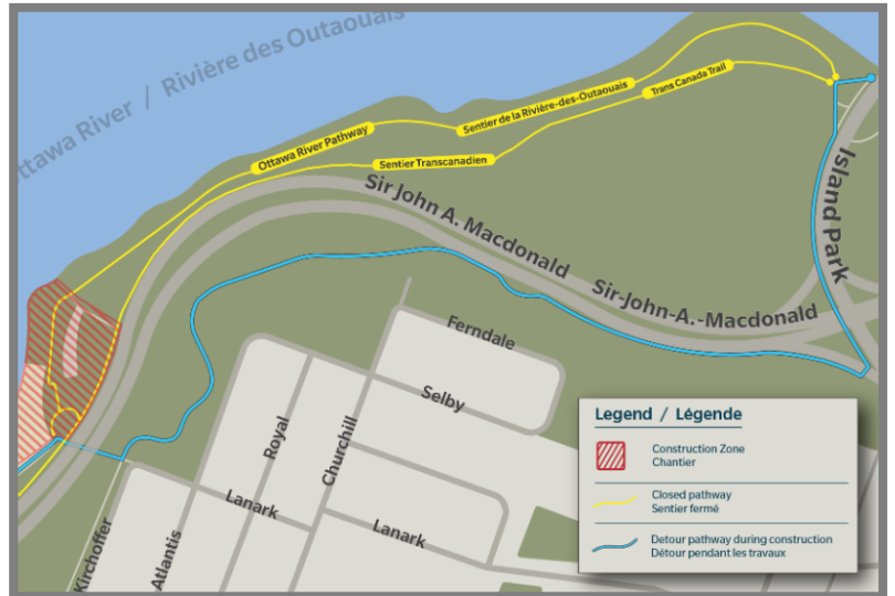
(Thanks to Richard Lochead for this update. Map courtesy of NCC.)

More detailed information can be found at this NCC online site .