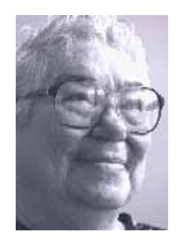
by Amy Kempster 722-6039

The Green Bin: As a community with a lot of people who already compost, many may be wondering, "why the green bin?" I was, too, until I looked at the items that are allowed in the green bin. To my astonishment, not only do they allow meat and fish, but also kitty litter and other pet waste (no plastic bags). I'm not sure of the logic of allowing this, but not diapers. However, those who walk their dogs and pick up after them now have a place to put the contents of the plastic bag they carry. Perhaps this will increase the number of those picking up after their dogs, and thus decrease contaminated storm water runoff to the river (see below). Other animal items allowed include animal bedding, fur, hair, and feathers, as well as pet food.