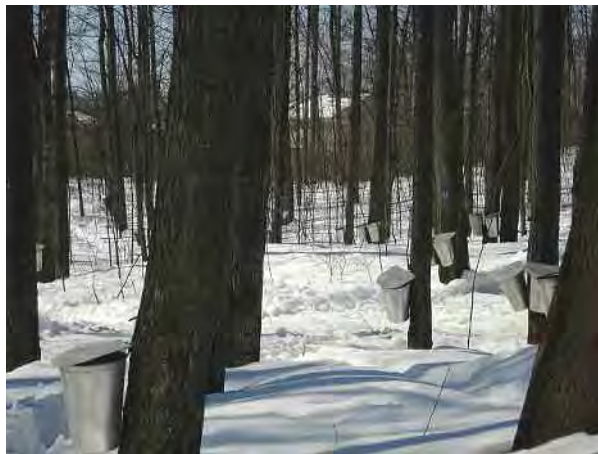
Ottawa's Richelieu Park (Vanier) A maple forest designated under the Ontario Heritage Act on February 17, 1997 by By-law 3604.

"Today, the 17.5 acres of the Richelieu Park remain a natural treasure in the midst of an urban setting"